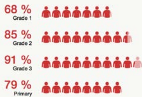
2016/2017 Grade 1 Reading Performance Standards