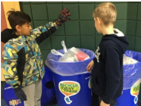
École Beausejour Early Years School

Next meeting dates: February 5, 2019, February 19, 2019.